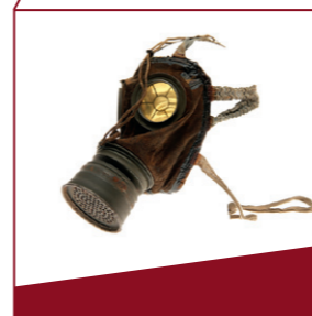
Gas Mask Since 1915 gas masks were part of the personal equipment.