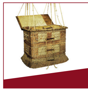
Balloon gondola Tethered balloons were used as observation platforms.