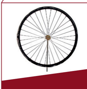
Bicycle tyre made of wire Rubber was scarce. Here it substituted by a spiral wire.