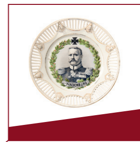
Wall plate Hindenburg was the most popular German military commander.