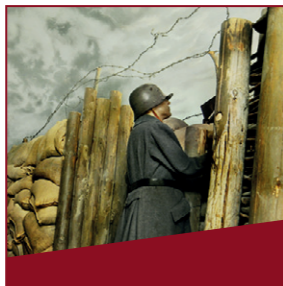
Trench warfare One room contains a mock-up of a frontline trench.