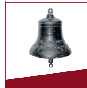
Ship's bell This bell comes from the battleship "Bayern".