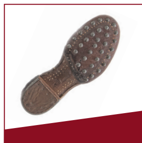
Jackboots The soles of the marching boots were studded with nails.