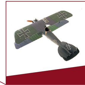
Aircraft model Fighter aircraft Albatros D V of 1917.