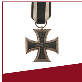
Iron Cross How a war decoration became a national symbol.